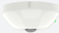
EL-DL2 Corridor Luminaire