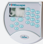
EL-KP Lighting System Keypad