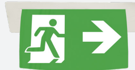
EL-REC (20 & 40) Recess Adaptor