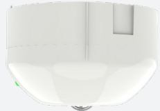
NFW89/O High Power Open Area Luminaire