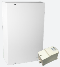
EL-2 & EL35V Panel & Power Supply