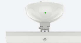
EL-20(WHT) 20m Exit Sign Frame