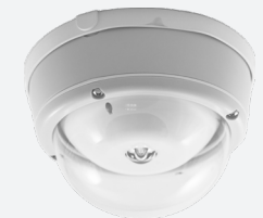
NFW68/89-IP64 Dome Enclosure