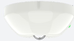
EL-DL3 Open Area Luminaire