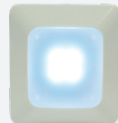
EL-SL Step Light