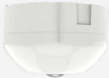
NFW89/C High Power Corridor Luminaire

To increase client confidence and reduce the need for return site visits, full training and support is available from the team of experts at Hochiki Europe throughout all stages of the project, ensuring optimal results and the successful delivery of the FIREscape system.