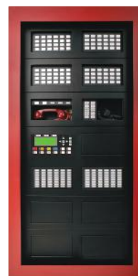
MMX-2003-12NDS in a BB-5014 with a DOX-5014MR