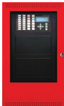
MMX-2003-12NDS in a UB-1024DS with a DOX-1024DSR

Designed for peer-to-peer network communications, the various MMX network panels allow for a maximum of 63 nodes, while providing reliability, flexibility and expandability.