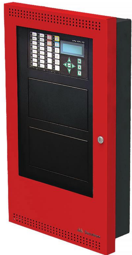
MMX-2003-12NDS in a UB-1024DS enclosure with DOX-1024DSR door (with optional DSPL-420-16TZDS Main Display module)