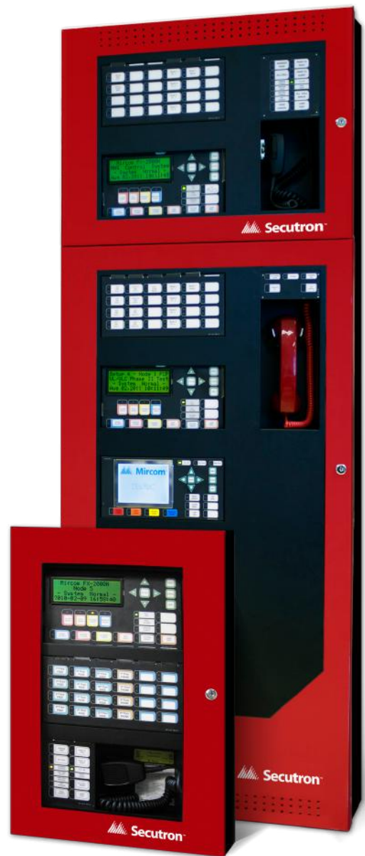
MMX Mass Notification Systems – Autonomous Control Unit (ACU) and Local Operating Console (LOC).